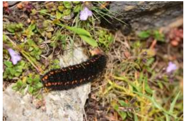
Parnassius apollo larva

< pamperis@otenet.gr > but also to go and look for Apollo in the Greek mountains especially where it appears to be present in the distribution map. The Apollo flies from June to August. If you do find it, please do a timed count as number of adults seen per hour. It is an easy species to identify.