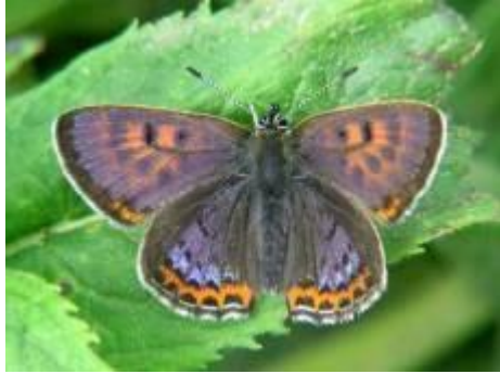
Violet Copper, Lycaena helle