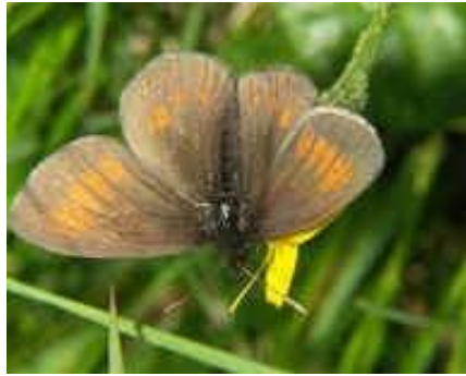
Eriphyle Ringlet, Erebia eriphyle