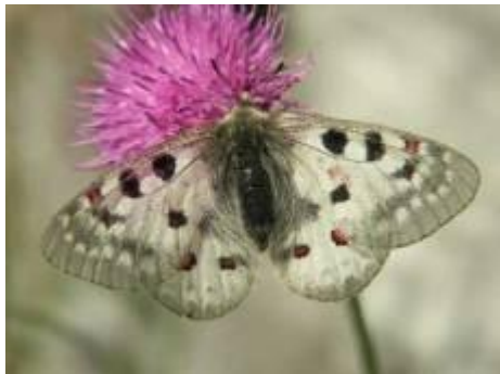
Small Apollo, Parnassius phoebus