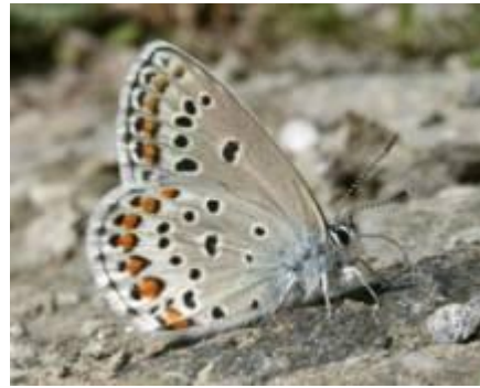
Warren's Skipper, Pyrgus warrenensis