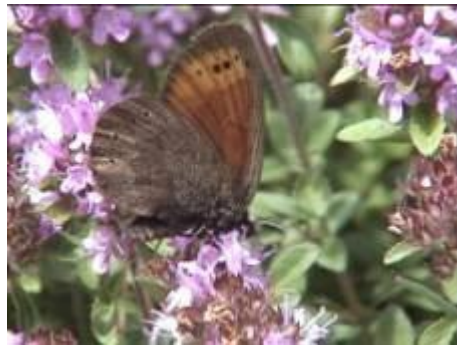
Raetzer's Ringlet, Erebia christi