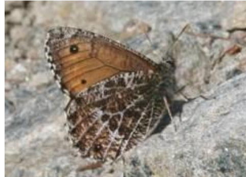
Alpine Grayling, Oeneis glacialis