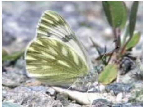
Peak White, Pontia callidice

The butterfly watcher who visits Switzerland is therefore greatly rewarded when visiting the mountainous regions of the centre, south and east.