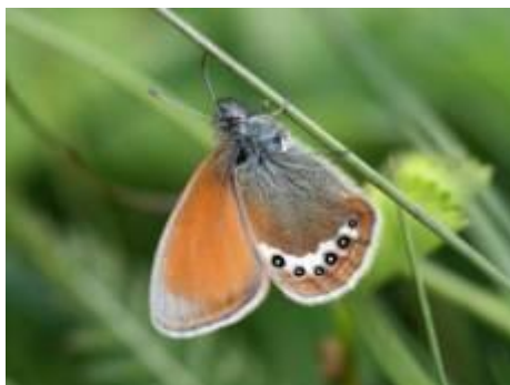
Darwin's Heath, Coenonympha darwiniana