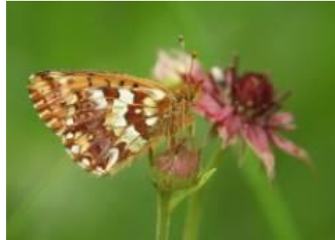
Cranberry Fritillary, Boloria aquilonaris