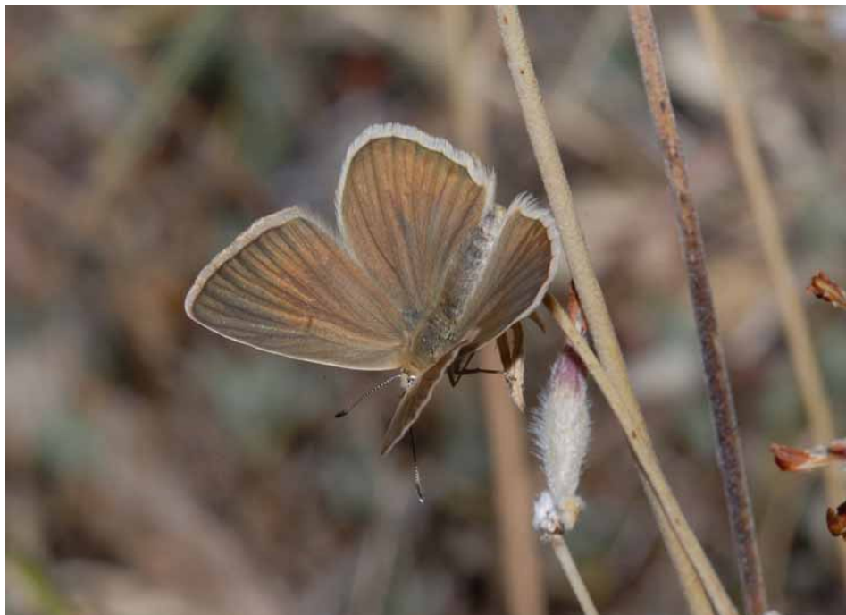
Female of Galloi's Anomalous Blue basking prior to roosting

Subsequent exploration revealed the species at other similar sites – dry grassy south-facing slopes, reminiscent of the habitat of other species in the ‘Anomalous’ group that we’d seen in other parts of Europe. In appearance, galloi closely resembles Ripart’s Anomalous Blue ( Agrodiaetus ripartii ), with extensive androconial patches on the male forewing upperside, and prominent white streaks on the underside hindwings in both sexes. The relationship between these taxa, currently recognised as distinct species would be worth further study.