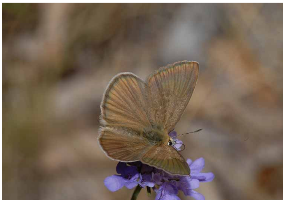
Male of Galloi's Anomalous Blue showing androconial patches on forewings