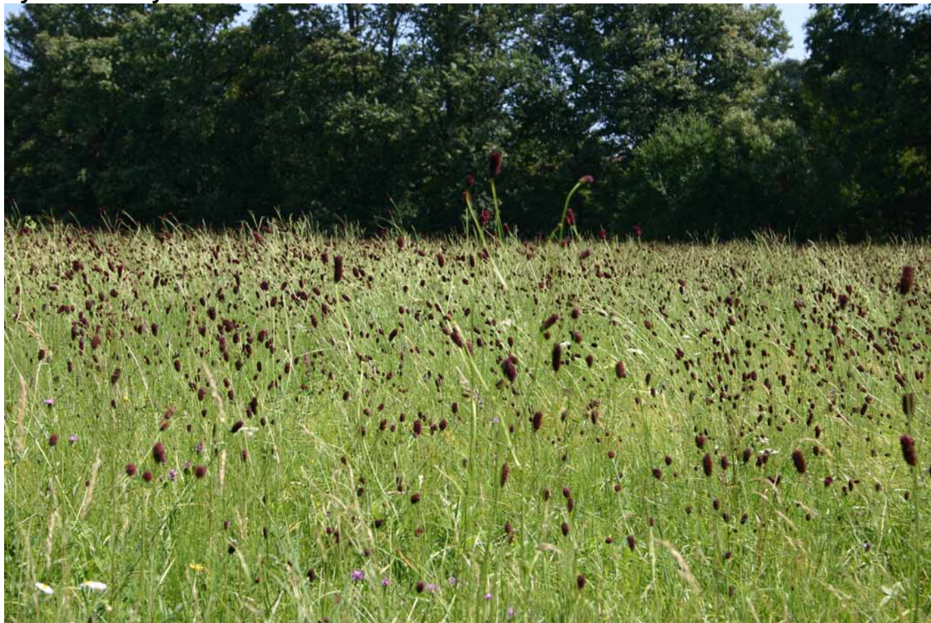
Sanguisorba rich meadow in Kerkaszomor