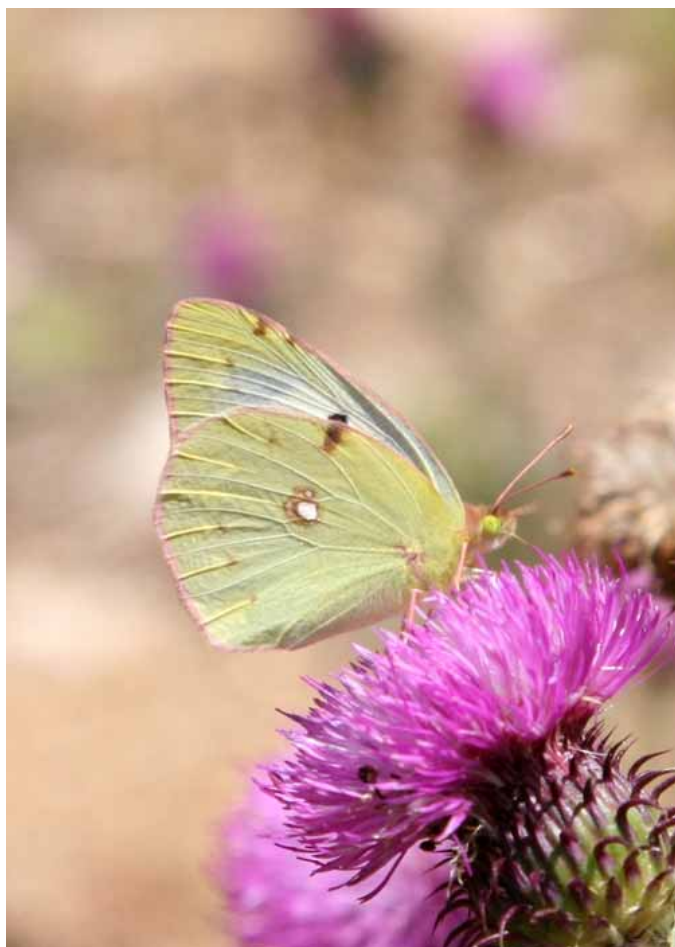
Pale Clouded Yellow Colias hyale

Two years ago my wife and I spent a happy week in Provence. It was towards the end of May and six of our seven days were warm and sunny. Great butterfly days, and we were not disappointed. It was wonderful to see so many of the British species that appear in South's 1906 book but are either now extinct or very rarely seen in Britain. No doubt about the Black-veined Whites (lots of them) and Large Tortoiseshells (everywhere in a field of thistles), Bath Whites, and Queen of Spain Fritillaries, all distinguishable immediately amid showers of local species. But it was not so easy to sort out the Clouded Yellows.