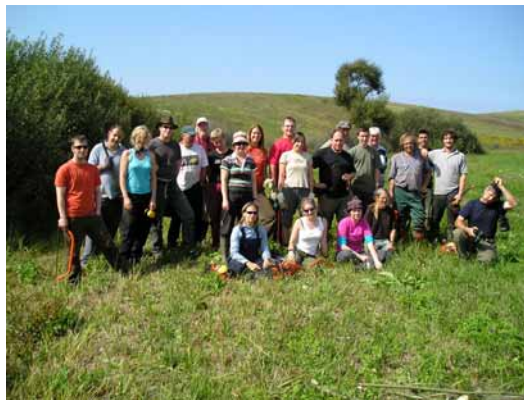
September 2007, Aggtelek National Park

We worked with the Aggtelek National Park staff and Hungarian student volunteers for a fortnight last September and it was a memorable experience for all concerned. Their hospitality was overwhelming: the superb programme of 'cultural' activities included a meal and a tasting session in a wine cellar in the Tokaj region, a concert of classical music in the famous Baradla cave, a visit to a food festival and hot baths in the central plain and a visit to a huge hilltop castle with a splendid view, where we were treated to wild boar stew and 'palinka' spirit served in small green peppers instead of cups (the ultimate in disposable tableware!). We will be returning to Aggtelek in July to help with butterfly monitoring and in September to continue with the scrub clearance in the deserted fields.