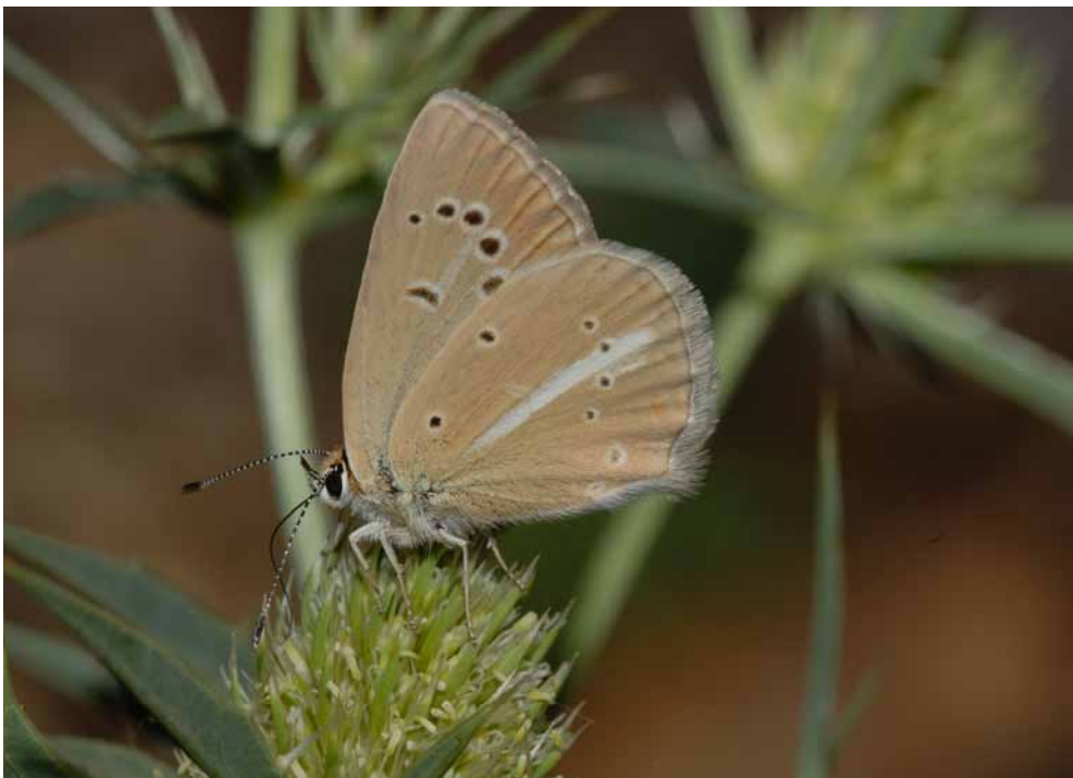
Female of Gallo’s Anomalous Blue ( Agrodiaetus galloi ) feeding from Eryngium

Within 2 to 3 hours of searching we found a female galloi , peacefully nectaring, wings closed, on a green-flowered Eryngium sp. growing at the foot of a steep grassy roadside bank (altitude 1470 mtrs). She continued nectaring, unaffected by our photography for several hours, while we turned our attention to the males, which were very actively flying over the slope, stopping only occasionally to nectar briefly from a species of Scabious. Late in the afternoon (5-6pm local time), individuals of both sexes shifted from nectaring to settle head-down on grass-tufts or on flower-heads. Here they would bask, often several close together, with wings open to the setting sun, before adopting the typical Lycaenid roosting posture – facing down, with wings closed.