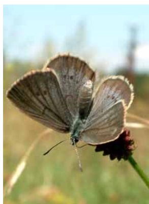
Maculinea telejus , Aggtelek.

The first phase of the project is funded until May 2009. For the second phase, due to run from August 2008 until May 2010, we have submitted another application for Leonardo funding and have established potential partners in two sites in Poland and one in the south-east of the Czech Republic. In Poland we will be working on grassland sites south of Warsaw which are the subject of Life projects particularly for the conservation of the Scarce Large Blue ( Maculinea telejus ), Alcon Blue ( M. alcon ) and the Violet Copper ( Lycaena helle ), and with a very go-ahead NGO in the west of the country called Pro-Natura which has purchased a number of damp grassland sites in the Barycz valley south of Poznan, where we hope to become involved in management work and butterfly monitoring.