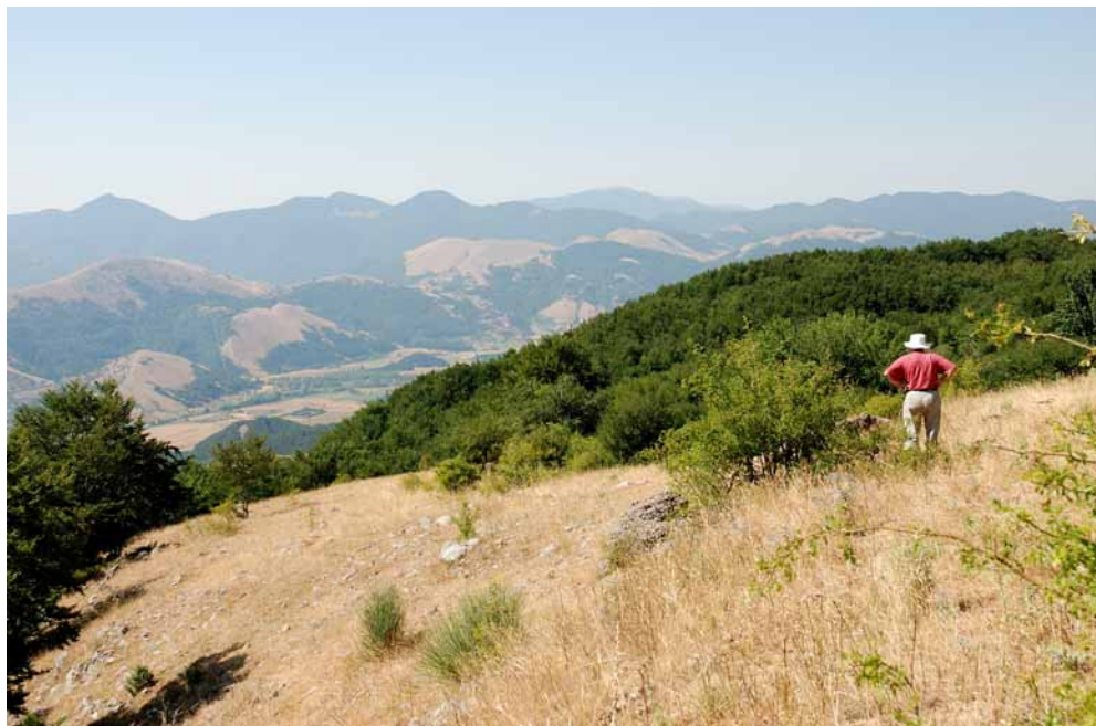
Habitat of Gallo's Anomalous Blue, Furry Blue and others, Monte Pollino, Calabria

Flying in the same habitats was another localised Agrodiaetus species – the Furry Blue ( A. dolus ), here represented by the form virgilius , with whitish uppersides in the male. Other species seen included Blue-spot Hairstreak ( Satyrium spini ), Scarce Copper ( Lycaena virgaureae ), Hermit ( Chazara briseis ) and Woodland Grayling ( Hipparchia fagi ).