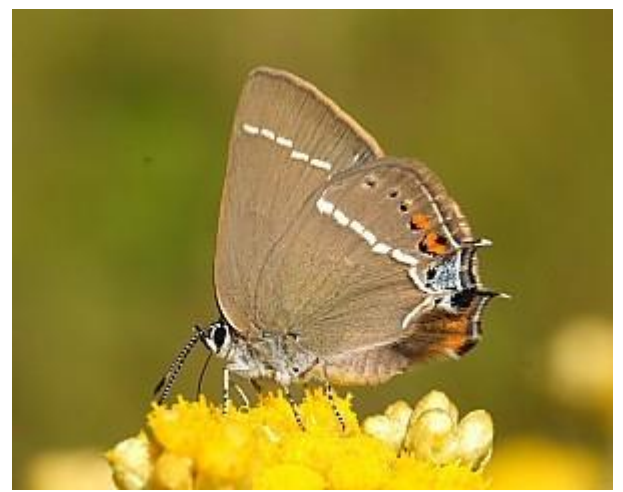
Blue-spot Hairstreak (Satyrium spini)

<u>Hairstreaks</u>: in late May a mass emergence of Satyrium species occurs: False Ilex Hairstreak ( Satyrium esculi ) in thousands, but also good numbers of Blue-spot Hairstreak ( S. spini ), Ilex Hairstreak ( S. ilicis ) and Sloe Hairstreak ( S. acaciae ), with limited numbers of White-letter Hairstreak ( S. w-album ). They feed avidly on the yellow Helichrysum flowers. Strawberry tree ( Arbutus unedo ) grows throughout the Massif des Maures and is the larval hostplant of Chapman's Green Hairstreak ( Callophrys avis ), as well as, perhaps oddly, Two-tailed Pasha ( Charaxes jasius ). Provence Hairstreak ( Tomares ballus ) is quite a rarity but quite difficult to spot in flight so maybe be under-recorded; its flight season seems over by the end of April. Spanish Purple Hairstreak ( Laeosopis roboris ) occurs in the western half of Var, usually near water.