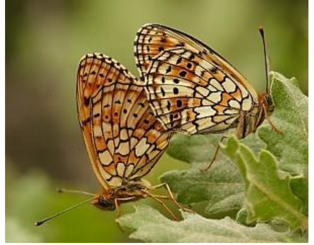
Twin-spot Fritillary (Brenthis daphne)

Pierids: Provence Orange Tip ( Anthocharis euphenoides ) seems quite ubiquitous in April and May. Portuguese Dappled White ( Euchloe tagis ) does occur but in a few rather remote localities.