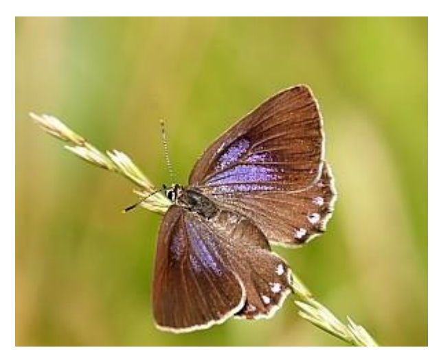
Spanish Purple Hairstreak (Laeosopis roboris)

<u>Blues</u>: Osiris Blue ( Cupido osiris ) is perhaps more widely distributed than Lafranchis suggests. Chapman's Blue ( Polyommatus thersites ) is also often encountered, especially the spring brood. Turquoise Blue ( P. dorylas ) and Escher's Blue ( P. escheri ) are encountered regularly in small numbers in the higher altitudes of northern Var. Amanda's Blue ( P. amandus ) occurs in one site at