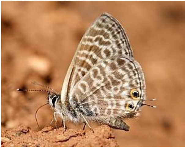
Lang's Short-tailed Blue (Leptotes pirithous)

Fritillaries: Niobe Fritillary ( Argynnis niobe ) is by far the most common argynnis species and the earliest to emerge in May; it is of the southern form eris . Dark Green Fritillary ( A. aglaja ) and High Brown Fritillary ( A. adippe ) are encountered much less frequently. Cardinal ( A. pandora ) is quite widespread and clearly double brooded May and September. Twin-spot Fritillary ( Brenthis daphne ) occurs in a few localities where Filipendula vulgaris grows.