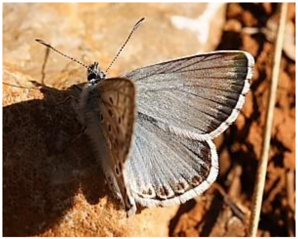
Provence Chalk-hill Blue (P hispana)