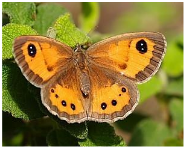
Spanish Gatekeeper (Pyronia bathseba)

Satyrids: The range of Western Marbled White ( Melanargia occitanica ) extends from the west in central Var and it seems quite widespread in the western half of Var in May and June. The hipparchia and related species emerge in August in the higher reaches of northern Var. False Grayling ( Arethusana arethusa ) and Tree Grayling ( Hipparchia statilinus ) are out in huge numbers and I have found one healthy colony of Hermit ( Chazara briseis ) at 950m. Woodland Grayling ( H. fagi ) occurs widely but in low densities. Spring Ringlet ( Erebia epistygne ) occurs in April but I have only found it in one locality. Heat-loving species such as Southern Gatekeeper ( Pyronia cecilia ), Spanish Gatekeeper ( P. bathseba ), Dusky Heath ( Coenonympha dorus ), are not uncommon. Autumn Ringlet ( E. neoridas ) is very common in northern Var from August onward.