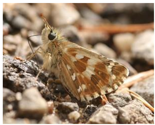
Rosy Grizzled Skipper (Pyrgus onopordi)

Pyrgus: Rosy Grizzled Skipper ( Pyrgus onopordi ) is the first pyrgus species to emerge in April, with only Grizzled Skipper ( P. malvae ) for company so no ID problem as the host of confusingly similar pyrgus species have not yet emerged. Yellow-banded Skipper ( P. sidae ) is quite widespread in May. Oberthur's Grizzled Skipper ( P. armoricanus ) and the so-called Cinquefoil Skipper ( P. cirsii ) emerge in large numbers in late summer. Safflower Skipper ( P. carthami ) occurs in the northern regions of Var.