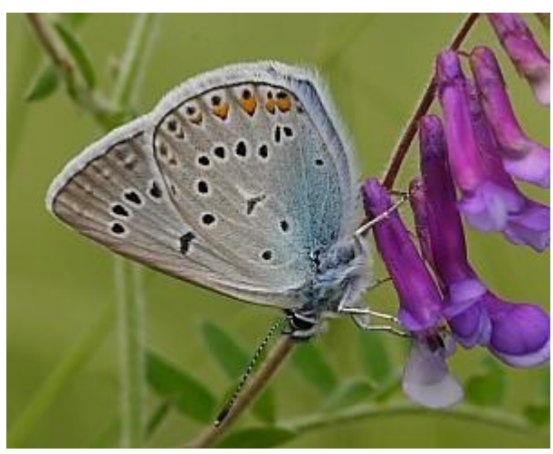
Amanda's Blue (Polyommatus amandus)

400m altitude, the lowest end of its altitude range according to Lafranchis, and it emerges here in mid-May, again much earlier than indicated by Lafranchis. Provence Chalk-hill Blue ( Polyommatus hispana ) emerges in May in large numbers, often not straying far from Hippocrepis comosa , with a second brood in late summer. Furry Blue ( P dolus ) occurs in a very few scattered locations. Blackeyed Blue ( Glaucopsyche melanops ) occurs in small numbers in some locations north of the A8 but its flight season seems over by mid-May. Lang's Short-tailed Blue ( Leptotes pirithous ) becomes very common in southern Var in September, although it is not clear whether this is a second generation or because of migration. Geranium Bronze ( Cacyreus marshalli ) is also widespread and common but highly sedentary, so often overlooked.