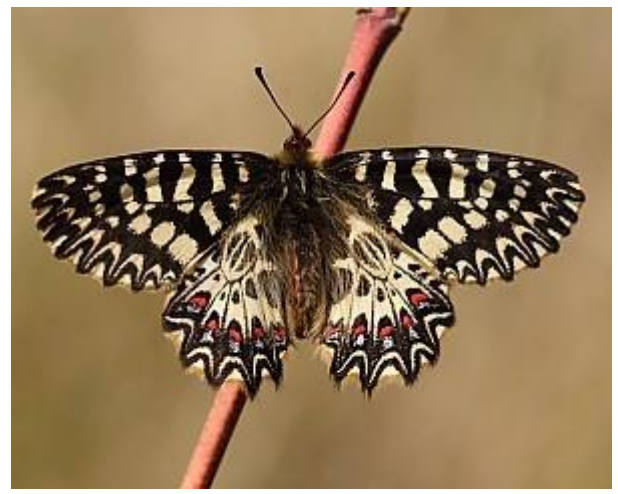
Southern Festoon (Zerynthia polyxena)

<u>Hairstreaks</u>: in late May a mass emergence of Satyrium species occurs: False Ilex Hairstreak ( Satyrium esculi ) in thousands, but also good numbers of Blue-spot Hairstreak ( S. spini ), Ilex Hairstreak ( S. ilicis ) and Sloe Hairstreak ( S. acaciae ), with limited numbers of White-letter Hairstreak ( S. w-album ). They feed avidly on the yellow Helichrysum flowers. Strawberry tree ( Arbutus unedo ) grows throughout the Massif des Maures and is the larval hostplant of Chapman's Green Hairstreak ( Callophrys avis ), as well as, perhaps oddly, Two-tailed Pasha ( Charaxes jasius ). Provence Hairstreak ( Tomares ballus ) is quite a rarity but quite difficult to spot in flight so maybe be under-recorded; its flight season seems over by the end of April. Spanish Purple Hairstreak ( Laeosopis roboris ) occurs in the western half of Var, usually near water.