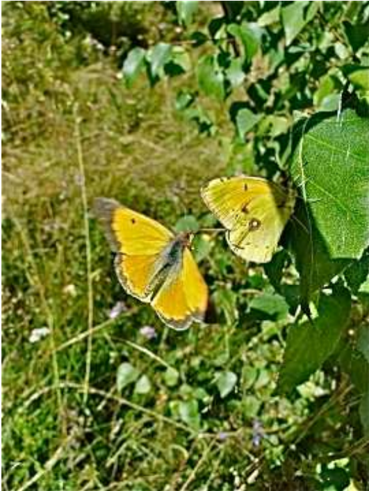
The Danube Clouded Yellow ( Colias myrmidone )

The Danube Clouded Yellow ( Colias myrmidone ) is amongst the most endangered butterfly species in Europe (classified as Endangered in the IUCN Red List, with a declining population trend, and Critically Endangered within the EU). With a range extending eastwards into Kazakhstan, the Volga basin and the Urals, it falls into that group of species which are on the extreme western edge of their distribution in Eastern and Central Europe and in common with others such as the False Comma ( Nymphalis vau-album ), seems to have undergone an eastwards regression over recent decades, possibly in response to fluctuations in climate. It is now thought to be extinct in locations such as Germany, Austria and the Czech Republic.