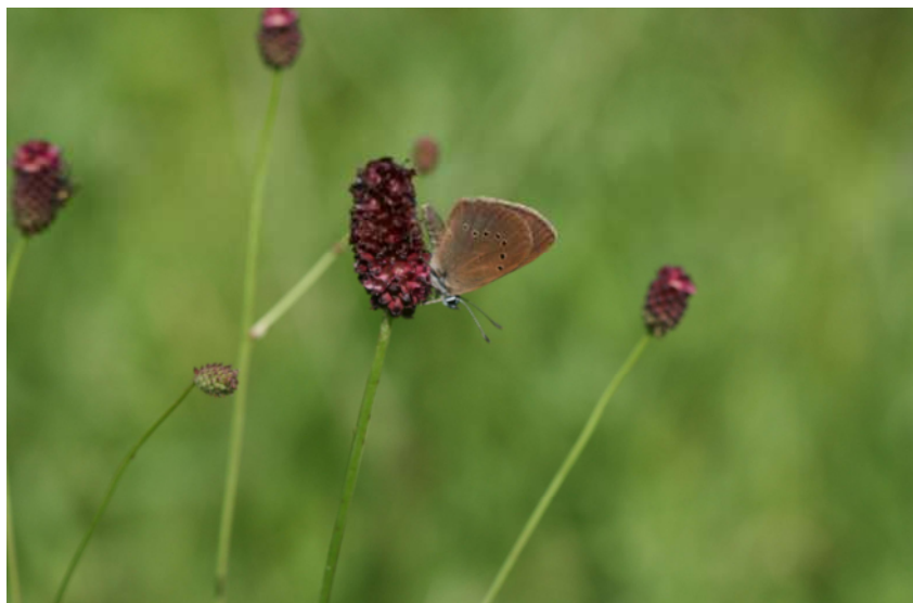
Dusky Large Blue ( P. nausithous)