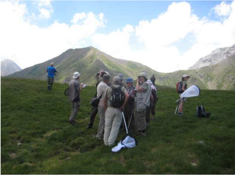
Looking for Gavarnie Ringlet ( Erebia gorgone ) Col de Tentès

The European Interests Group (EIG) of Butterfly Conservation organizes or coordinates visits by its members to locations around Europe where team effort can help with habitat improvement and enhance the quality of search, recording and monitoring of butterflies, particularly notable species as defined by the IUCN. In this case the objective was to establish records, rigorously checked and verified, in the departments of the Haute Pyrenees (65) and Ariège (09), to add to the information required to produce a distribution atlas for the region of the Midi-Pyrenees.