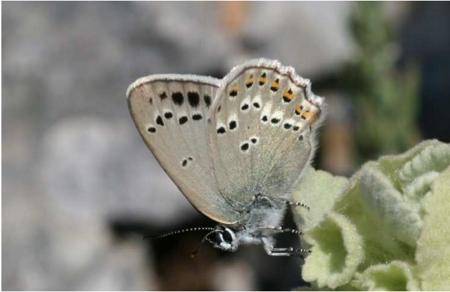
Oranged Banded Hairstreak ( Satyrium ledereri)