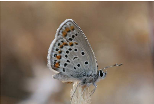
Eastern Brown Argus ( Plebejus eurypilus ) © Nigel Peace

As noted in Tolman, Orange-banded Hairstreak is found on Mount Kerkis (= Mt Kerketefs) at 1000m to 1400m. On our first morning we set off up the said mountain in search of our quarry. We were able to take the jeep to about 800m. From there we followed a path towards the summit and after a couple of hours of rather energetic hiking we reached some sheltered slopes at the requisite altitude. There we found several nice specimens of our target species.