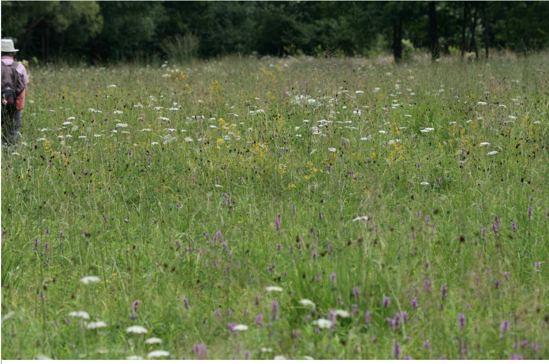
Wet Meadow Kerczsomor

The Hungarian National Heritage Trust organised a butterfly and habitat visit to the far west of Hungary. Their own land is at Kerczsomor in the Orseg National Park. 2 sites near Lake Balaton were also included.