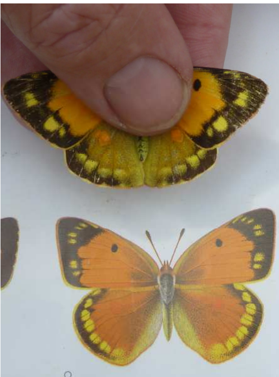
Danube Clouded Yellow ( Colias myrmidone )

The long journey to our target area of Hungarian speaking northern Romania, Transylvania, began early in the morning with little time even for comfort breaks; again our journey was virtually due East. By lunchtime we had crossed the border into Romania and stepped back in time to early 20 th century Europe. The journey was hampered by numerous horses and carts travelling at a trot through landscapes dotted with Ceausescu's white elephants such as power stations without a coal supply and vast dams creating only a tiny head of water. However the great news was that agriculture operating as had been the case for a century, (we even saw ox carts), required hay instead of petrol to drive the wagons and the pattern of small strip fields in many areas bode well for Lepidoptera.