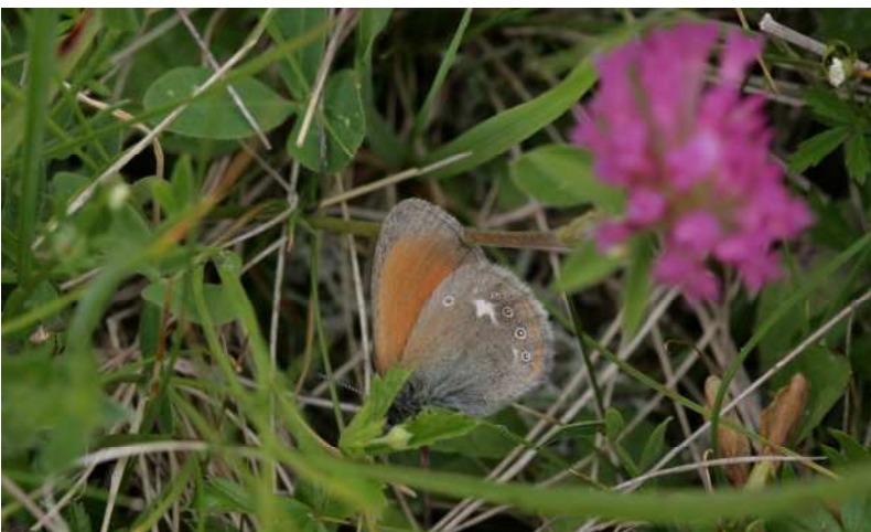
Eastern Large Heath ( Coenonympha rhodopenensis )

Going north past Niksic we stopped near Vidrovan and visited rocky grazed meadows edged with trees. Great Sooty Satyr ( Satyrus ferula ), Large Tortoiseshell ( Nymphalis polychloros ) and Spotted Fritillary ( Melitaea didyma var. meridionalis ), the female var with grey forewings replacing the bright orange of the normal form, basked in the hot sun. Many hectares of hayfields were being cut by hand-operated mechanical cutters. The hay is left on the ground to dry in traditional fashion allowing caterpillars to crawl off to the grass and herbs below. 45 species were recorded here in one hour.