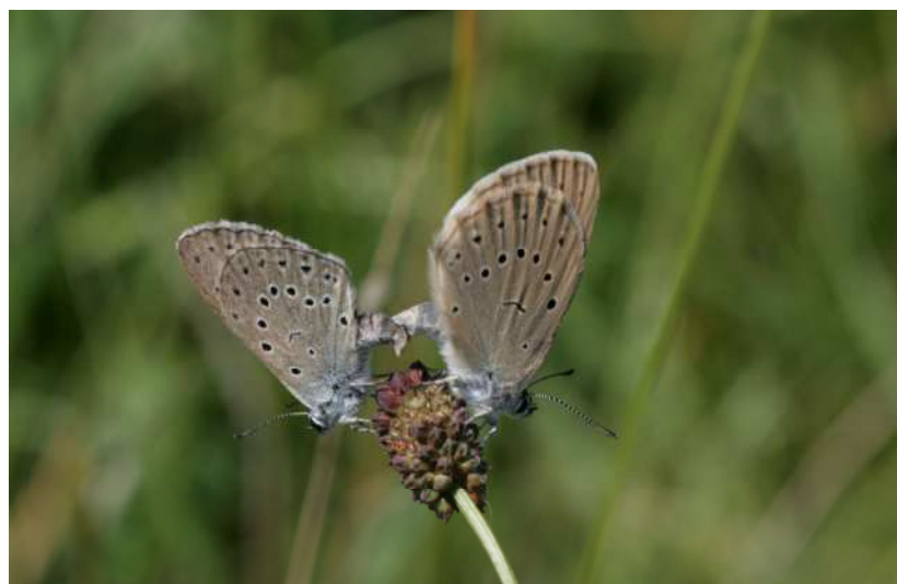
Scarce Laræ Blue ( Phengaris teleius )

July 10 th Back in the Orseg National Park we visited Szalafo and meadows (about 20ha) cut in June for hay removed under National Park Management. Records for NP records were verified