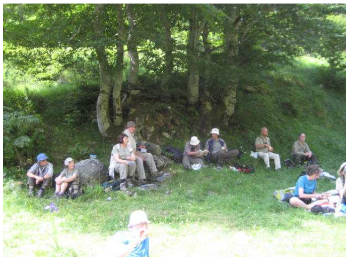
Group enjoying lunch

We were greeted by sun and cloud and wonderful views all around us on this day spent in the area around Gavarnie. This is a species rich part of the Pyrenees and we were not disappointed. Nets were in action early and group discussion became earnest as species after species were shown. Marbled Skipper ( C. levatherae ) was quickly identified, others less speedily agreed, a Swallowtail ( P. machaon ) was seen and then Apollo ( P. apollo ); in addition to the 'Blues' we had seen the previous day we noted Small ( Cupido minimus ), Chalkhill ( Polyommatus corydon ) and Amanda's Blue ( Polyommatus amanda ). Bright-eyed ( Erebia oeme ) and Yellow-spotted Ringlet ( E. manto ) were new species for the trip, as was Woodland Grayling ( Hipparchia fagi ) and Mountain Argus ( Aricia artaxerxes ); both Meadow ( M. parthenoides ) and Heath Fritillary ( M. athalia ) were seen. Rosy Grizzled Skipper ( Pyrgus onopordi ) was identified towards the end of the morning to add to Large Grizzled ( P. alveus ) and Olive Skipper ( P. onopordi ). What we had not seen were Small ( B. selene ) and Pearl-bordered Fritillary ( B. euphrosyne ), nor Alcon Blue ( P. alcon ).