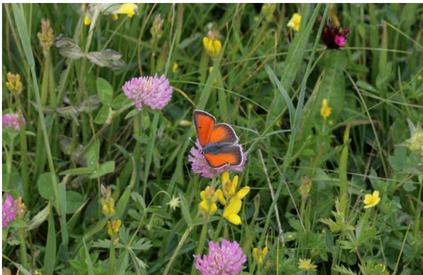
Balkan Copper ( Lycaena candens )

After heavy overnight rain we set out to explore Durmitor National Park now a UNESCO World Heritage Site which was a Princes Reserve as early as 1870. From 1600 metres the Tara canyon drops to 300 metres, on this occasion a misty bottom. We walked through a native conifer forest to flower-filled alpine meadows where ( Coenonympha rhodopenensis ) were just climbing up the herb stems. Its hind wing polygon patch was the consistent diagnostic as its hindwing spots varied from zero through to five large ones. Flowers here included Cow-wheat, Bladder Gentian and Yellow Wood Violet set in a yellow sea of greenweed.