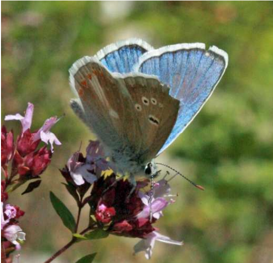
Transylvanian Turquoise Blue ( Polyommatus dorylas magna )

It's not often that you come across a distinctive subspecies of a butterfly that's not mentioned in the common literature, but the Transylvanian Turquoise Blue ( Polyommatus dorylas magna ) is one such example.